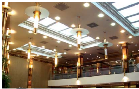
Double-height exhibition area