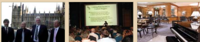
NETWORK AND RELAX... ALONGSIDE PROFESSIONAL DEVELOPMENT, CERTIFICATE, CEUS