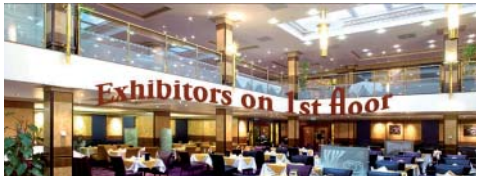
Exhibits 18-25 overlook atrium

UK/EUROPEAN SYMPOSIUM ON ADDICTIVE DISORDERS 13-15 May 2010